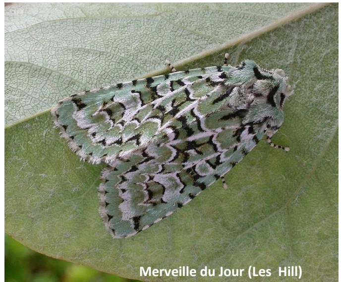
Merveille du Jour

Throughout the year we have had good numbers and diversity of immigrant moths turning up in the trap, including Bordered Straw, Four-spotted Footman, Rush Veneer and Dark Sword-grass. We are currently finding that autumnal moths are low in number and slightly later than usual. One of the most stunning moths that we have trapped recently at Manor Yard was Merveille du Jour.